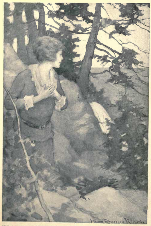
SHE COULD NOT BELIEVE SHE WAS AT WINDOVER UNTIL SHE HAD FELT THE SEA-WIND WHIP HER CHEEKS Chapter XXIX